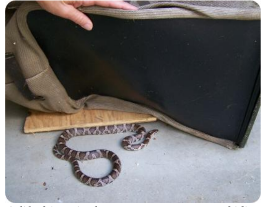
A lifted item in the garage may expose a hiding milk snake. The mutual surprise may elicit tailvibrations from one, a shriek from the other.

Behavioral adaptations take many generations to evolve, some taking hundreds or thousands of years to develop. The fact that a behavior evolves at all evinces its advantage to the species' survival. In a number of non-venomous Michigan snakes a behavior has evolved to effectively mimic a rattlesnake by vibrating the tail. The snakes using this ability include Michigan's three constrictors (rat, milk, fox) as well as the racer. Since none of these possess a rattle, one may assume the vibrating tail is soundless. However, the tail vibrates at an intensity that makes it a blur to the human eye. If it vibrates against any surface – the ground, a wall or even its own body – a buzzing noise is generated.