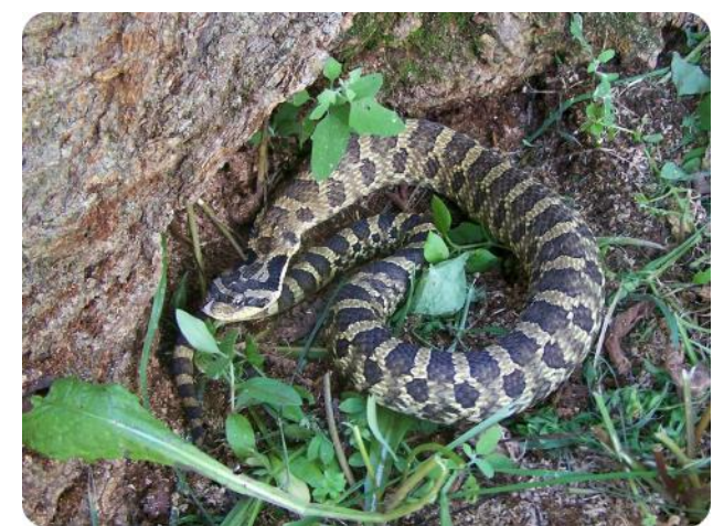
The Eastern Hognose is a stout-bodied, slow-moving snake. To counter this limitation it is loaded with a mix of behavioral tricks to discourage large creatures that get too close. Biting is NOT one of them.

Watch a snake climb a tree. See snakes eating worms, fish, frogs and mice. Lots of handling and photo opportunities, too. Visit Nature Discovery's entire zoo that also includes Michigan-native turtles, frogs, salamanders and lizards. Knowledgeable staff is on hand to help visitors of all ages make the most of their visit.