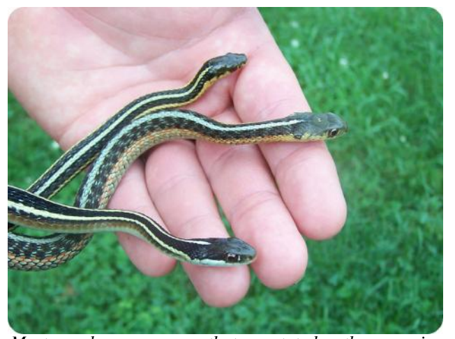
Most people are unaware that our state has three species of garter snakes. Here's a chance to get to know them and to become adept at telling them apart. Why is this important? One species has declined dramatically right here in mid-Michigan over the past two decades.