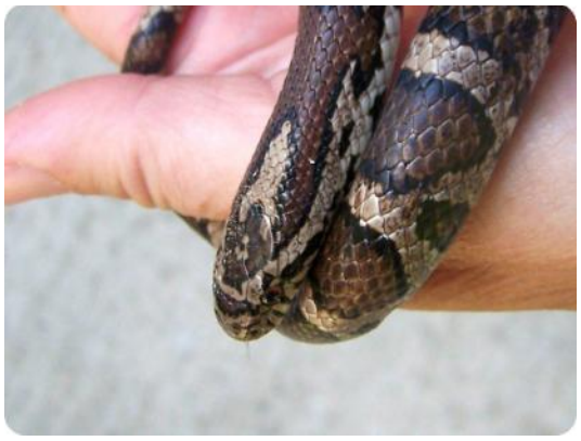
The telltale head...

About ninety percent of the time a prominent visual characteristic works to aid identification: a tan, forked shape thinly outlined in black on top of the base of the head. The quality of this fork varies widely and may look like a V, Y, U or a check mark if one arm is longer than the other. We refer to the other ten percent as exhibiting still another variation of the pattern – a broken fork. Imagine a V with a missing arm or with the bottom apex erased. It becomes much more difficult to recognize as a fork variation. However, with experience, viewing the most atypically-forked marking on a milk snake's head should not stump the viewer.