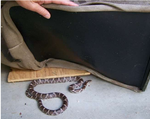
A lifted item in the garage may expose a hiding milk snake. The mutual surprise may elicit tail-vibrations from one, a shriek from the other.