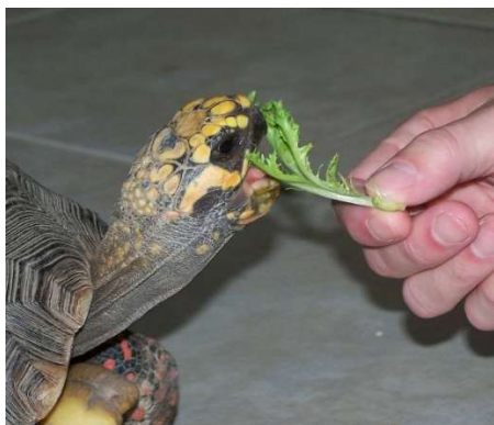
Hand-feed lettuce to “Milberta.”

The sky's the limit for natural science learning here – with a Michigan twist! Adults, couples and families are welcome to schedule a safe, intimate outdoor or indoor visit to what we call “The Biggest Little Nature Center in Michigan,” and “Home to the Largest Zoo of Michigan-native Reptiles and Amphibians.” The unique, in-person, hands-on experiences here are unmatched by a trip to a conventional zoo! We will bring snakes, turtles, frogs and salamanders out of tanks to interact with adults or students of any age or grade-level. Currently, mask-wearing is optional during indoor time.