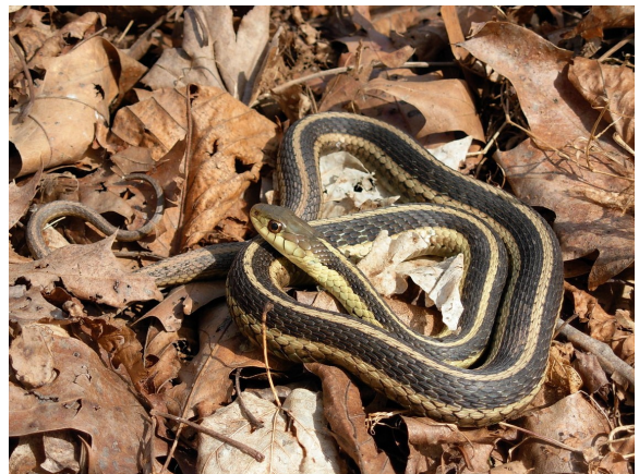
Since the Eastern Gartersnake is the most commonly seen snake in yards and around houses individuals frequently choose favorite basking spots and hiding places around porches and stoops.

If Carol or I are not immediately available we have access to a number of sidekicks, starting with our sons who would love to make the run for us if they are available. Whether it's a garter that's in your garage or maybe basking in your flower bed, or a milk snake after mice in your basement or tool shed, a staff member can safely capture then relocate it in appropriate habitat far away from your home.