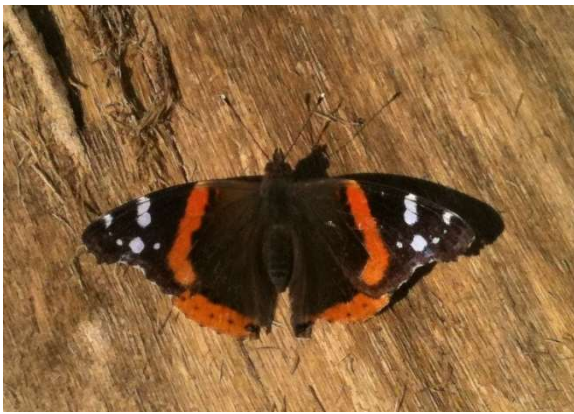
A Red Admiral basks on a barkless log.

alter some attitudes, especially if those forms of animal life are deemed especially pleasing to the average gardener.