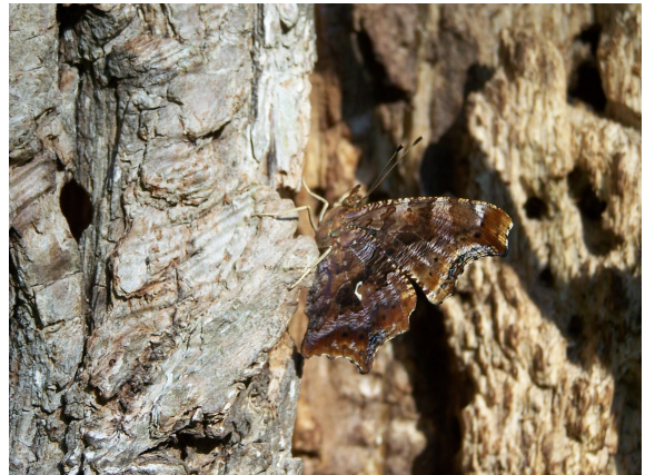
Perched with wings closed, an Eastern Comma melts into a background of tree bark.

In flight on a warm, sunny day, any of these species can be extremely difficult to follow with the eye, as they zig-zag up, around, in front of, then behind you. Although more brightly-colored above, the underwing surface of each species is composed of mixed hues in various patterns of rust, brown and gray. Thus, when a nettle butterfly lands, its wings close over its back and the cryptic, camouflaged pattern of the upright underwings helps it to disappear into the background hues of tree bark, leaf litter, or bare soil.