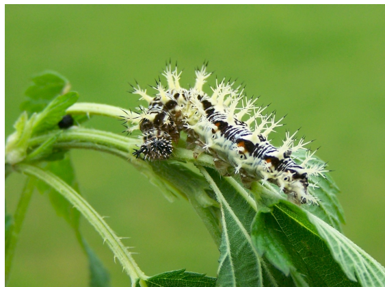
A 5 th instar Eastern Comma.

Observe the larvae of any of any of these butterflies on stinging nettle over time, and you will inevitably become