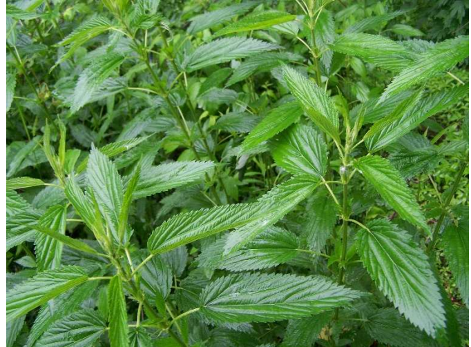
Nettle patches are prevalent on our property, and that's okay.