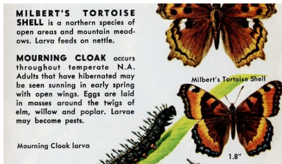
The Milbert's Tortoiseshell illustrated on a page from the Golden Guide to Butterflies & Moths.

Unlike the others, the female of this species lays a cluster containing dozens of eggs on the new growth at the tip of a nettle stalk. The slim, finely-bristled, gray-and-yellow striped larvae hatch then feed gregariously, methodically munching their way down the stalk. Days later they will have stripped the entire stalk of leaves. Then they are driven by hunger to crawl away from the stalk in search of another.