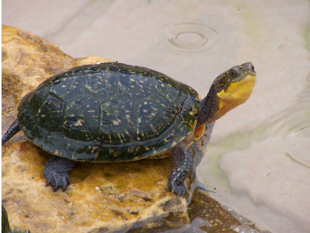
The Blanding's is the only Michigan turtle to sport a solid, bright-yellow chin and throat.

5900 N. Williamston Road Williamston, MI 48895 517.655.5349 naturedisc87@gmail.com www.naturediscovery.net