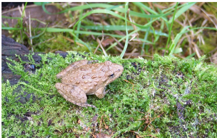
See the rare Blanchard's Cricket Frog.

Handle Michigan's three species of garter snakes while learning how to tell them apart, then watch them gobble up worms and live frogs. “Wear” a 6-foot Black Rat Snake – the largest in the state!