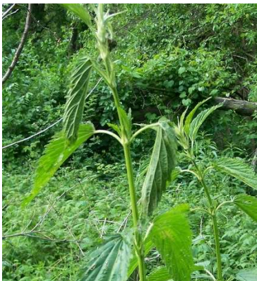
Folded nettle leaves droop from the weight of larvae hidden within.

Red Admiral caterpillars are probably the easiest to find on nettle stalks, that is, if you know the means by which they hide in a leaf. The female lays conical, green eggs individually, usually among the topmost, newest growth on the stalk. A newly-hatched, dark, spiny caterpillar perches and rests on the top of the leaf, then uses silk, in effect, to fold the leaf in half, lengthwise around itself. Thus enveloped, it is shielded from the sight of many prospective predators.