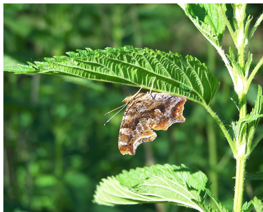
An Eastern Comma clings to a nettle leaf.

Given their propensity for hyperactive flight you could easily miss a nettle visit by an ovipositing female of one of these species. Turning your back on a nettle for less than a minute provides plenty of time for a female Question Mark to zip up, lay an egg or two, and be gone.