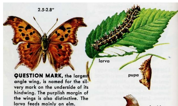
The Question Mark illustrated on a page from the Golden Guide to Butterflies & Moths.

A related circumstance occurred once, while we were exhibiting at an outdoor event at a park on a summer day. I had placed a clipped nettle stalk about three feet in length that protruded from a bottle of water on the display table. A small sign in front of the bottle that read, Can you locate the Red Admiral Butterfly larva hiding on this stinging nettle? At one point several visitors had gathered in front of the nettle while