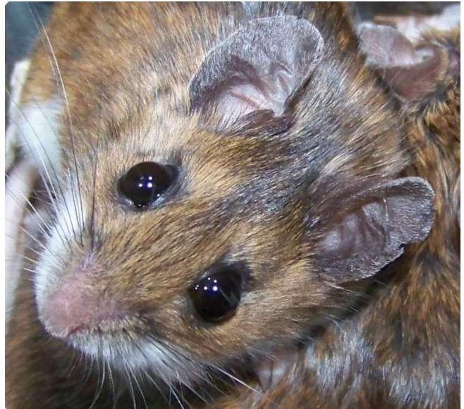
The Deer Mouse is prolific and abundant in rural settings.

Doors open from 1 to 5pm Admission: $5/person