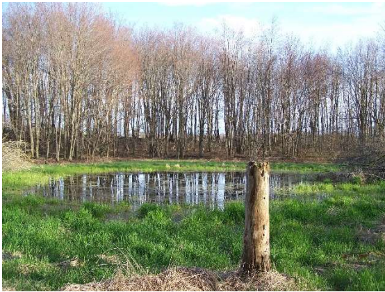
Our front vernal pond greens up in early April. The ponds are directly or indirectly responsible for most of the wild diversity here.

observation over decades within the boundaries of such a specific location engenders many, equally-prolonged considerations which, by extension, promote a level of concern that is apt to elude the casual visitor.