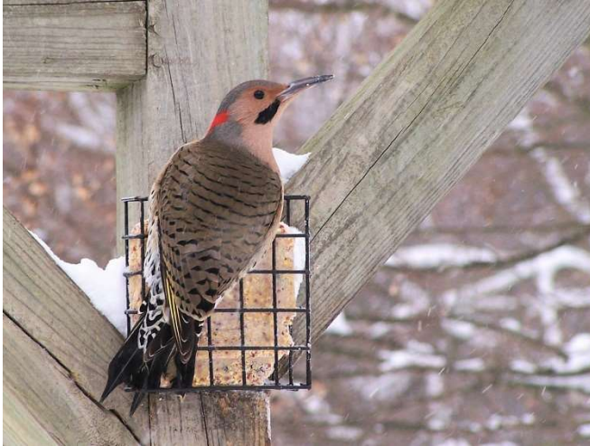
Entry Number 30, the Northern Flicker, wasn't tallied until March of 1989, during our first year here. Now, a flicker at the suet is not an uncommon sight at any point through the winter months.