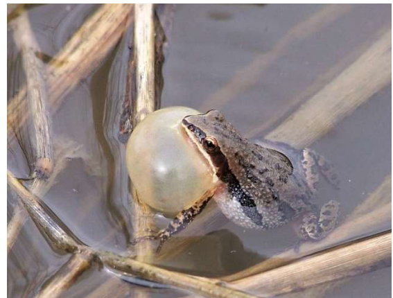
In recent springs the few vocalizing chorus frogs are a far cry from the cacophony recorded here in the 90s for our Frogs of the Great Lakes CD.

While all those listed have been found throughout our years here, amphibian abundance, in general, has declined overall. Based on intensity of vocalizations the Western Chorus Frog and the Northern Leopard Frog have declined by well over ninety percent.