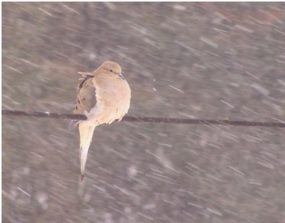
By late February, inclement weather can't even quell the coos of doves, nor other early singers.

Largely shut from late summer through early winter, the “auditory door” of avian diversity is now ajar, and the sounds produced by the above relative handful of permanent residents are wafting through. The