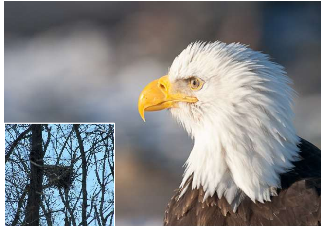
See a Bald Eagle nest at Potter Park.

For individual adults, adult couples, families, and other small groups, and a great remedy for the COVID-winter blues! Parents , this is an excellent way to get your home-bound students out of the house and into the fresh winter air while providing a fun and educational opportunity that may very well bloom into a lifetime interest! Adults/Retirees , a first excursion might just hook you... You may find yourself propelled into an engaging hobby that you'll wish you had found years ago!