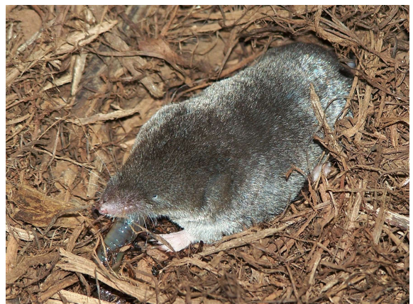
Feed crickets or worms to our recently acquired hyper and voracious Short-tailed Shrew.

Contact us for more info or to make an appointment.