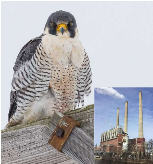
See Peregrine Falcons.

For individual adults, adult couples, families, and other small groups, and a great remedy for the COVID-winter blues! Parents , this is an excellent way to get your home-bound students out of the house and into the fresh winter air while providing a fun and educational opportunity that may very well bloom into a lifetime interest! Adults/Retirees , a first excursion might just hook you... You may find yourself propelled into an engaging hobby that you'll wish you had found years ago!