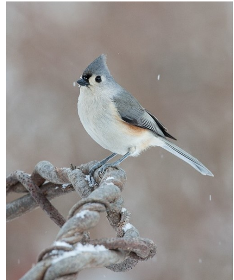
Tufted Titmouse.

A few mornings later I heard it again, and coming from the same direction. The chickadee sang several rounds this time. Then, from the woods to the north a different chickadee echoed the tune. A minute later, though, both reverted to silence. Fast forward a few more days. Chickadees everywhere were beginning to sing the tea-cher song. With each passing day the number of vocalists as well as the frequency of their songs rose as incrementally and as assuredly as the sun’s northward shift. On one morning just last week during my 3.4-mile trek around the country block I counted this territorial tune from at least a dozen different individuals.