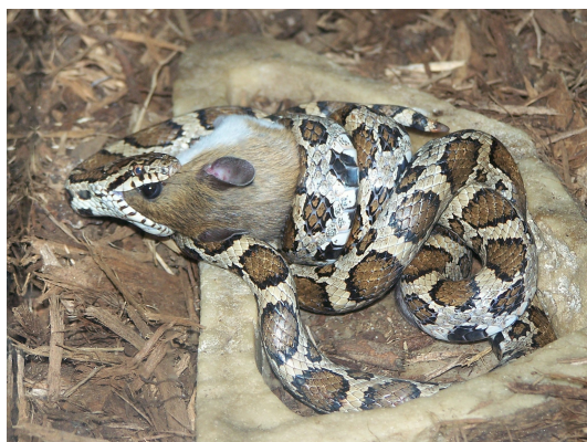
It's a mouser, not a milker.

When a species is first “discovered,” whether by scientist or layperson, it is given a name relatively quickly. Therefore, little may yet have been known about its behavior and ecology. Further study of the species might then eventually reveal a contradiction to the initially-given name. Certainly one of the more gross examples involves the surmised origin of the name, “milksnake.”