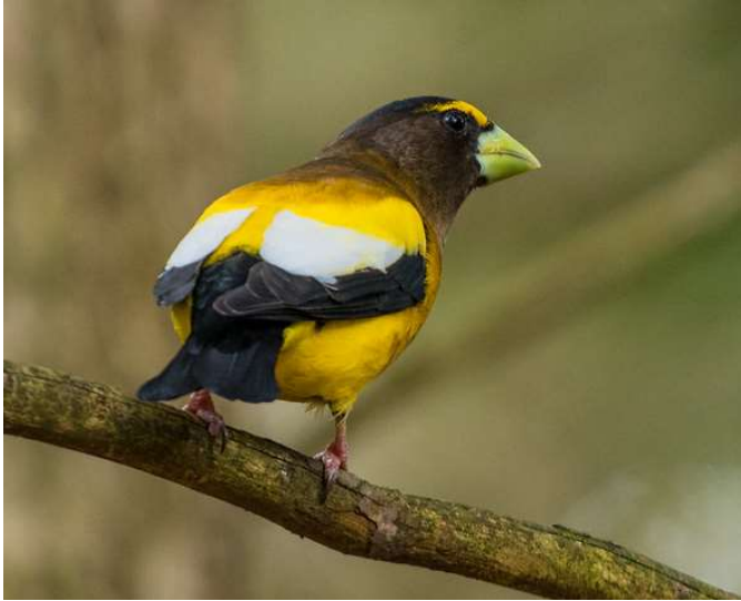
The Evening Grosbeak has no nocturnal tendencies. So, what's up with the name?