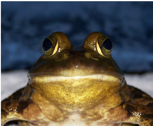
This Bull Frog is more excited than it looks to snatch a worm out of your fingers.

Identify and feed “the grand slam of Michigan turtles” - all ten species native to our state! Meet, pet and feed “Milberta”, our always hungry Red-footed tortoise.