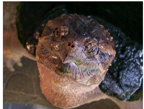
Nature Discovery's gentle snapping turtle patiently awaits a handout.

Upon mention of the snapping turtle I brace myself for the nearly inevitable comments that follow, no less from adults: "Whoa, watch out for that one," or "That one is mean." We are thus prompted to explain that a wild turtle of nearly any species may attempt to bite to defend itself; from our experience a snapping turtle is no more likely to bite than