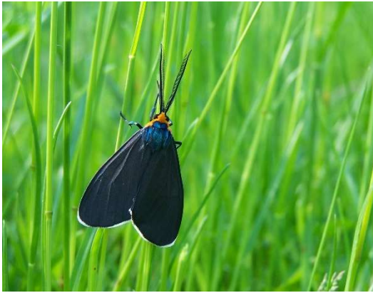
The Virginia Ctenucha Moth, with a range well beyond that state, has a name that is easily mispronounced, meaningless to most, and difficult to remember. Why not just Iridescent Grass Moth?

protocol. While many already fit these suggested criteria (i.e., Chipping Sparrow, Blue Racer, Meadow Vole, Spring Peeper, Tiger Swallowtail) those that don't also abound. In fact, pertaining to Michigan species alone, compiling a list of common names that I would characterize as "less-than-useful" could take several pages.