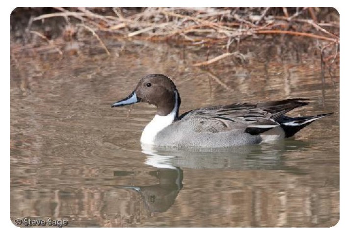
The Pintail is one of about 20 waterfowl species expected on our Waterfowl Migration Birding Day.

Mid-April is the peak time for spring waterfowl migration through Mid-Michigan. Join an intimate guided trip in our minivan to Maple River State Game Area north of St. Johns, followed by a stop at Park Lake on the way back to check out up to twenty species of waterfowl through our spotting scope. We'll also encounter a slew of other species including Bald Eagle, Osprey, American Woodcock, Wilson's Snipe and more. We'll view two active Great Horned Owl nests, too. As many as 60 total species are in store through the day. Participants will be given bird checklists to keep track of the day's finds. Feel free to pack any food/drink you like to consume on the road through the morning.