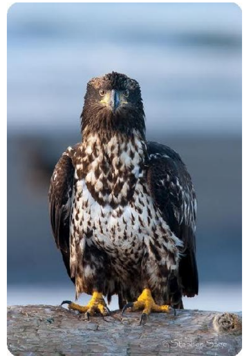
A 2 nd -year Bald Eagle sports the brown and white pattern of youth.

Interested in a special guided appointment to view the eagle nest through our spotting scope? Contact us to set a day and time.