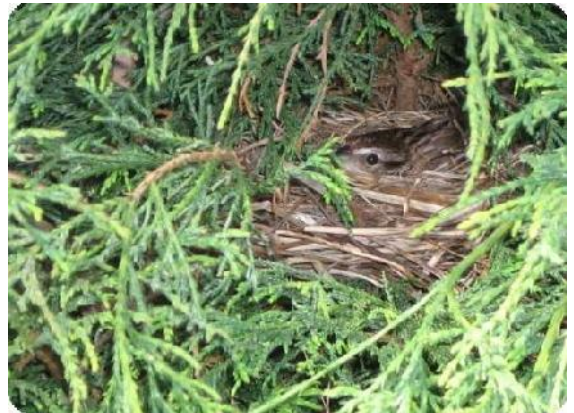
A Song Sparrow hunches down in an attempt to avoid detection. It built the nest in a dense juniper bush just inches outside our window.

At the presentation's conclusion participants are encouraged to join us on a guided walk around the Nature Discovery grounds. We will identify birds, explore potential sites for nests, and enjoy many other natural aspects of the advancing season.